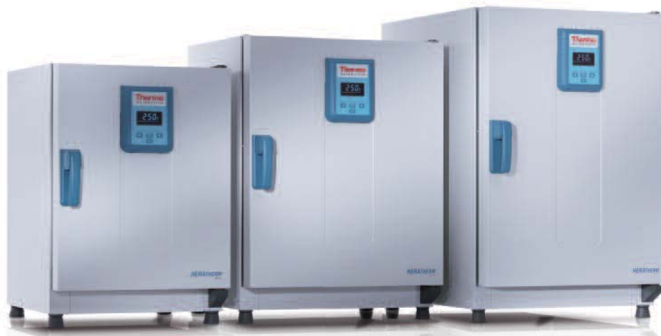
60 L, 100 L, 180 L models shown

Heratherm ovens have a smooth inner casing with easy to clean rounded corners