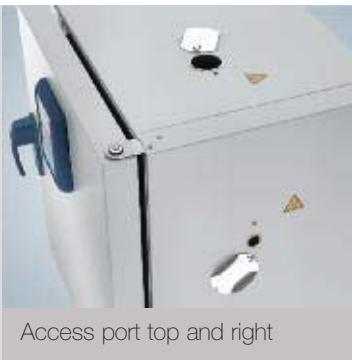
Access port top and right

Please ask for our special solutions. We can provide Heratherm tabletop ovens for cable testing applications, clean room applications, and inner casing with conditional gas-tightness for inert gas applications. We can provide additional access ports for the large capacity ovens at your preferred position, on demand.