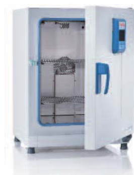
All Heratherm Advanced Protocol Security ovens are available in coated or stainless steel exterior. (model 100)