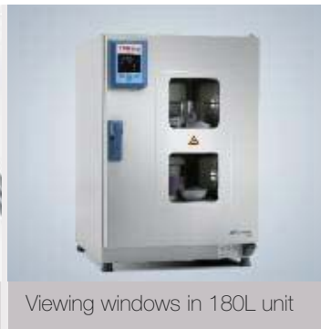
Viewing windows in 180L unit