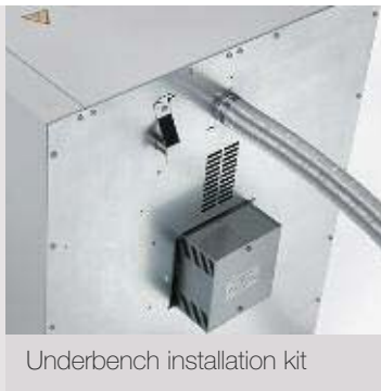
Underbench installation kit