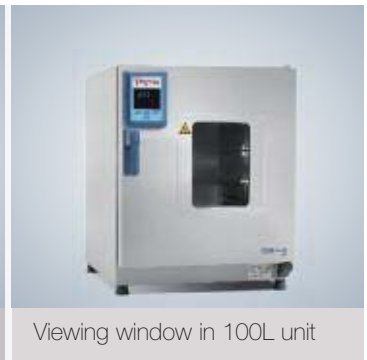
Viewing window in 100L unit