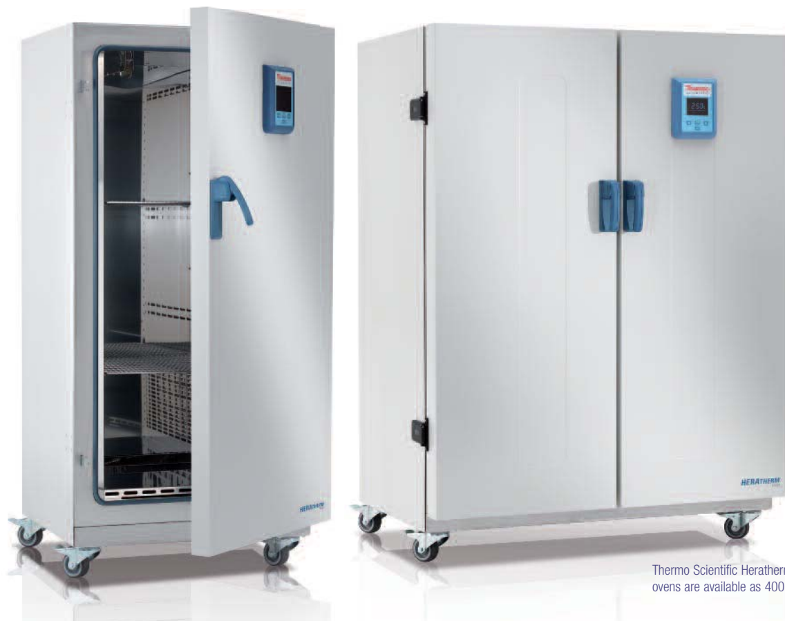
Thermo Scientific Heratherm large capacity ovens are available as 400 L and 750 L units

Heratherm large capacity ovens have been designed with your need for larger samples or high sample volume in mind. The General Protocol ovens provide high capacity for your day-to-day drying and heating applications.